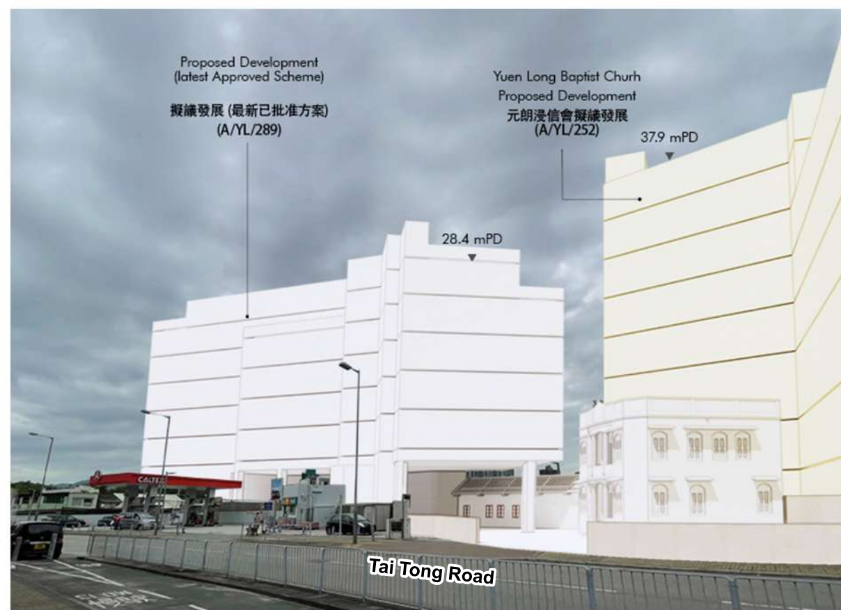
Tai Tong Road Approved Scheme (A/YL/289)