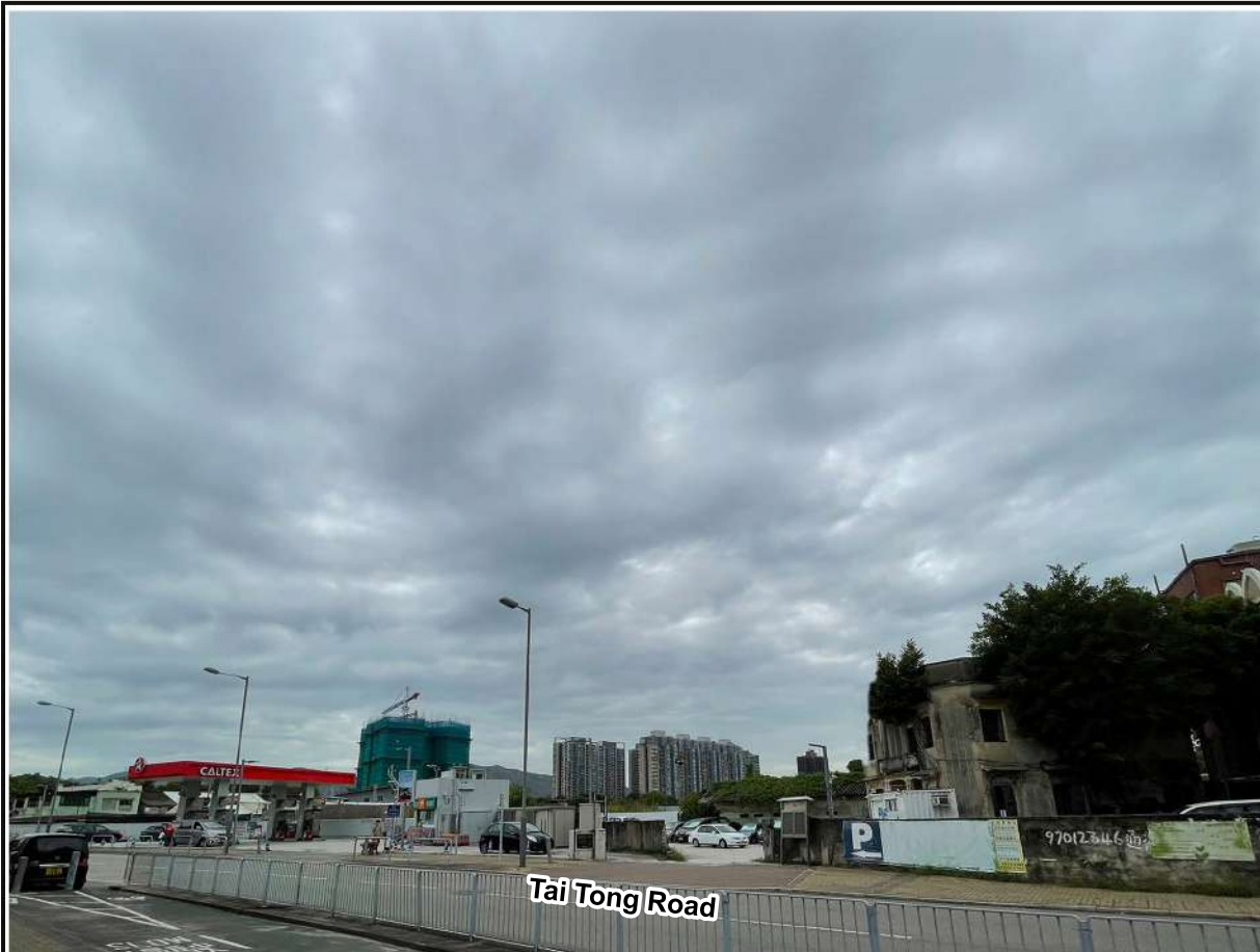
Tai Tong Road Existing Scheme