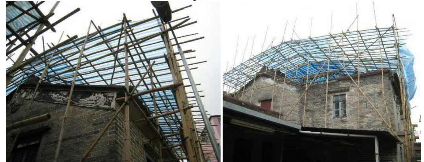
Tat Yan Study Hall

As an approval condition of the Second Planning Application, the Applicant has to submit a Conservation Management Plan (CMP) for the conservation of Siu Lo, and a full set of photographic and cartographic records to AMO for its endorsement. Comprehensive aspects of historic building conservation have been covered in the CMP, including but not limited to the following aspects:-