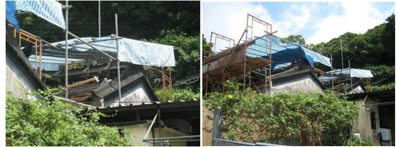
Tsang Ancestral Hall

Reference has also been made to other projects to study the space needed for the pitched roof maintenance works, which suggest that the 1.5m clearance (with additional 0.3m currently proposed as compared with the Second Approved Scheme) with a slant roof of the Annex Block as the basis will be sufficient for the future maintenance of the Annex Block including its roof.