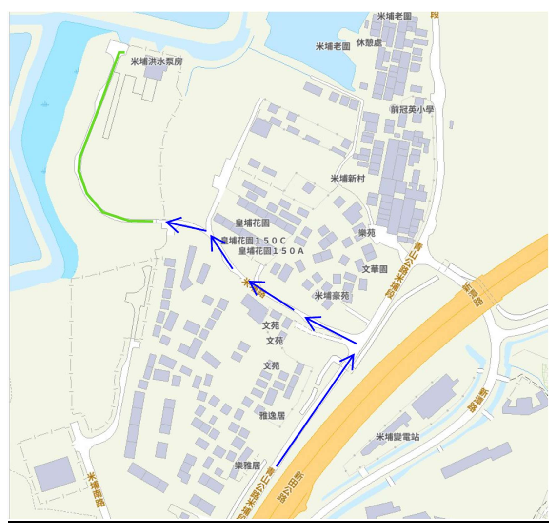
Vehicular Access Plan