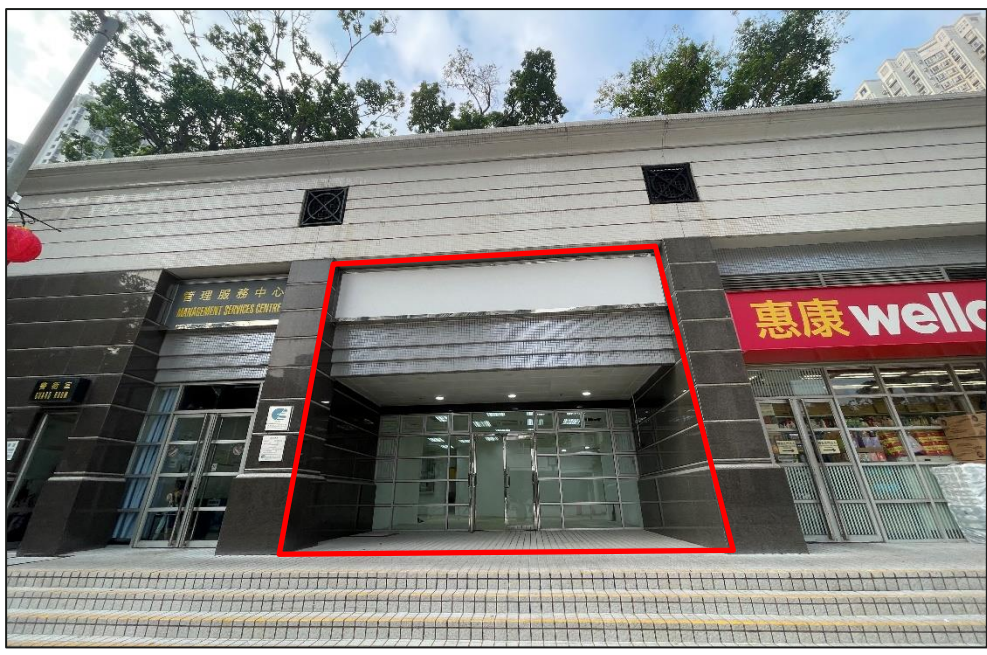
Figure 2. Site Photo of the Application Premises