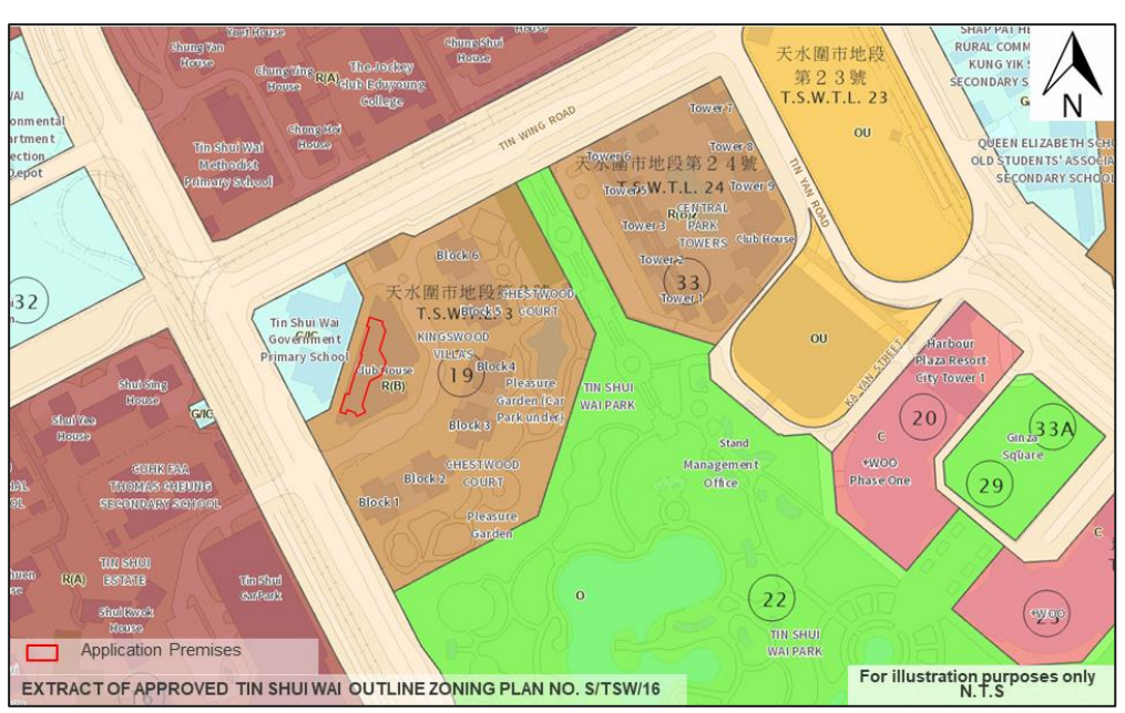
Figure 1. Location Plan