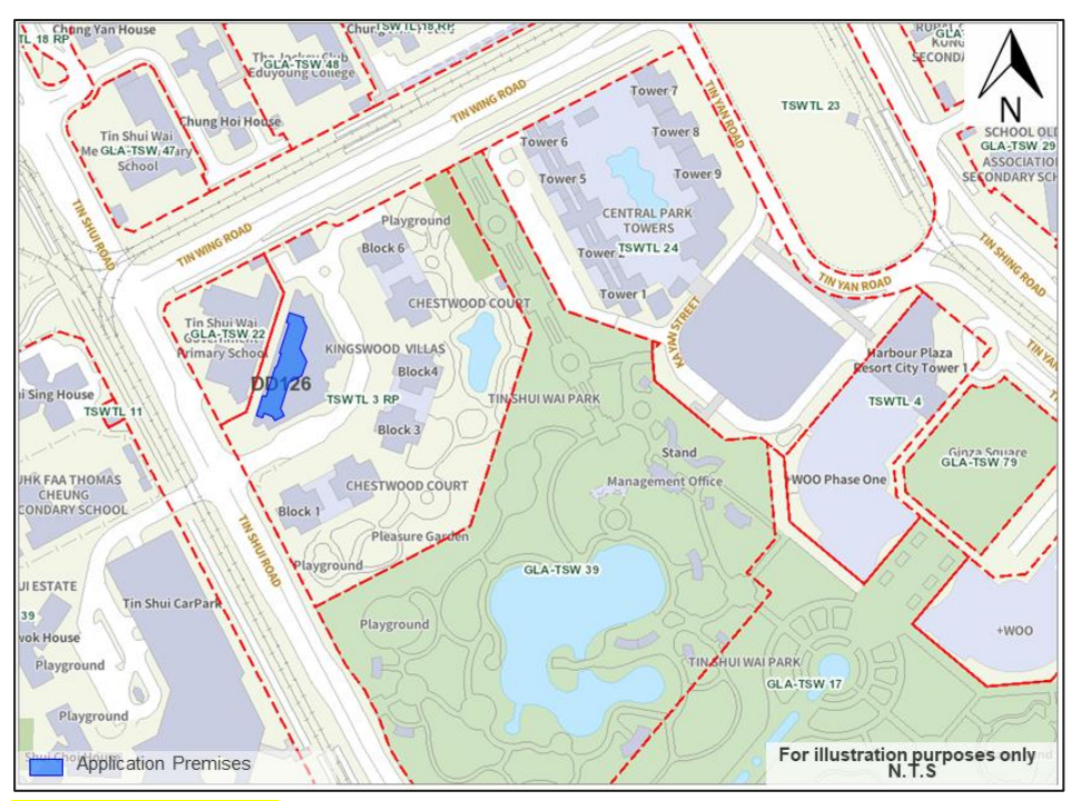
Figure 3. Lot Index Plan