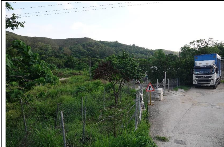
Photo 1. General View of Subject Site