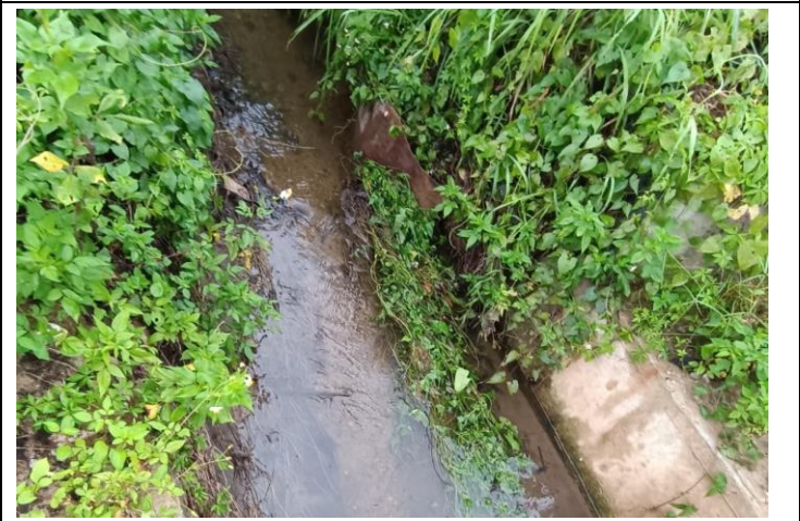
Photo 4. Watercourse within Subject Site