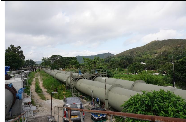
Photo 3. General View of Subject Site