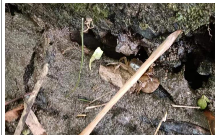
Photo 5. Somanniathelphusa zanklon