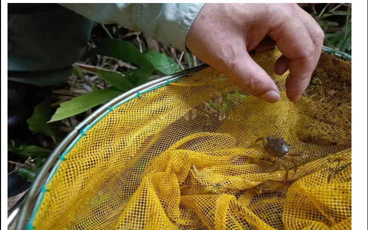
Photo 6. Somanniathelphusa zanklon