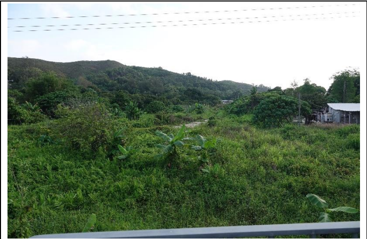
Photo 2. General View of Subject Site