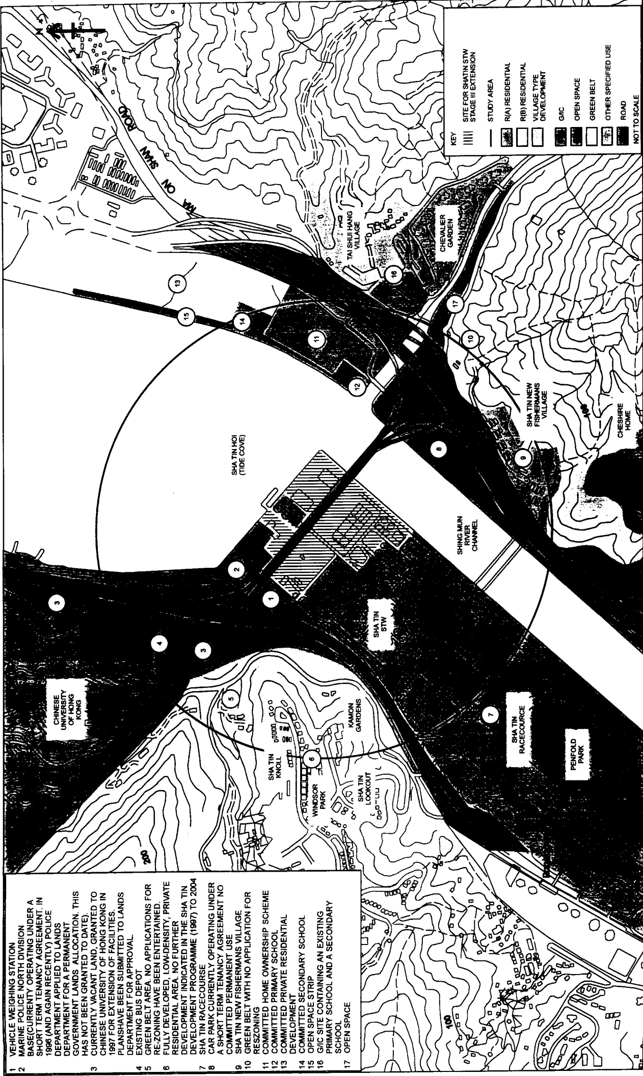
LOCATION OF THE PROJECT AND EIA STUDY AREA