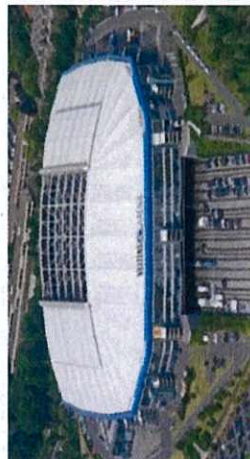
Veltins Arena, Gelsenkirchen, Germany