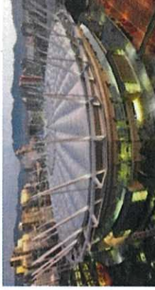
BC Place, Vancouver, Canada