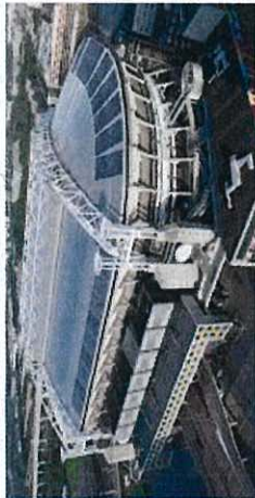
Amsterdam Arena, Netherlands