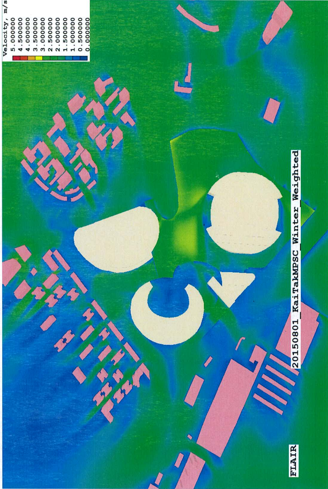
Winter weighted average wind velocity contour plot at pedestrian level