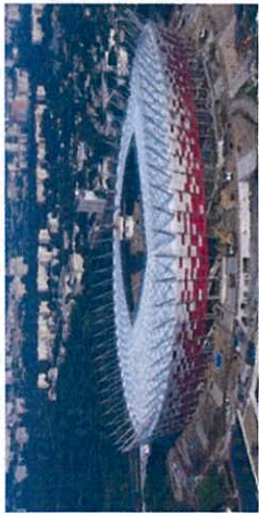
National Stadium, Warsaw, Poland