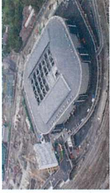
Friends Arena, Stockholm, Sweden