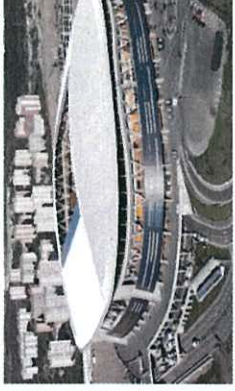
Turk Telekom, Istanbul, Turkey