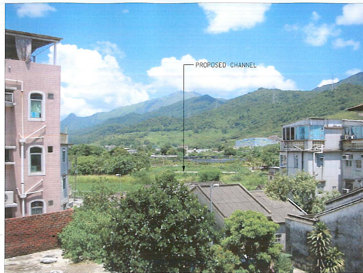
View without Mitigation Measures on Day One