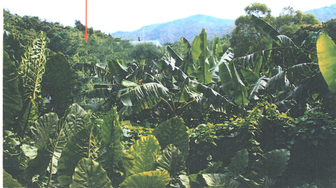
KV 3 - PROPOSED RECONSTRUCTION OF PUI O RAW WATER PUMPING STATION YEAR 10 OPERATION WITH MITIGATION MEASURES