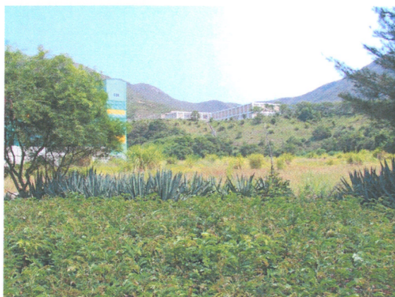
Existing View of KV 2