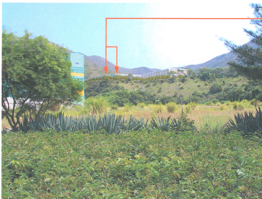
(Alternative Option) KV 2 - PROPOSED SHW WTW EXTENSION DAY 1 OF THE OPERATION WITH MITIGATION MEASURES