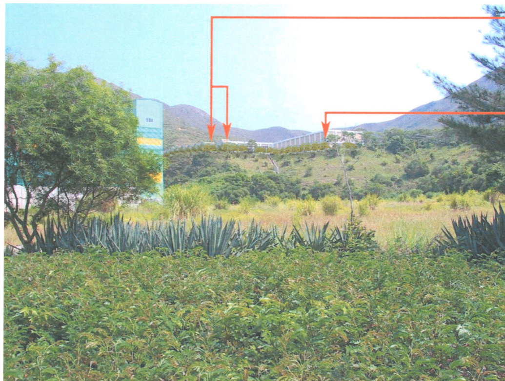
KV 2 - PROPOSED SHW WTW EXTENSION DAY 1 OF THE OPERATION WITH MITIGATION MEASURES