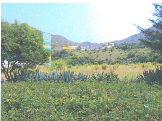
Photomontage of KV 2 without Mitigation Measures