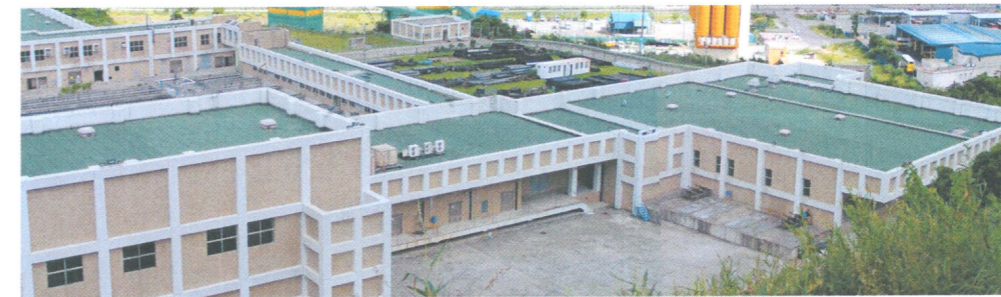
LMM 2: Compatible architectural design, construction materials and finishes with the existing WTW plants.