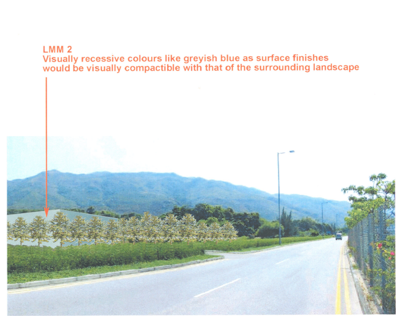
(Alternative Option) KV 1 - PROPOSED SHW RAW WATER BOOSTER PUMPING STATION DAY 1 OF THE OPERATION WITH MITIGATION MEASURES