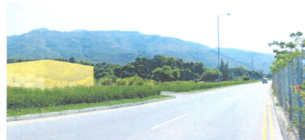
Photomontage of KV 1 without Mitigation Measures