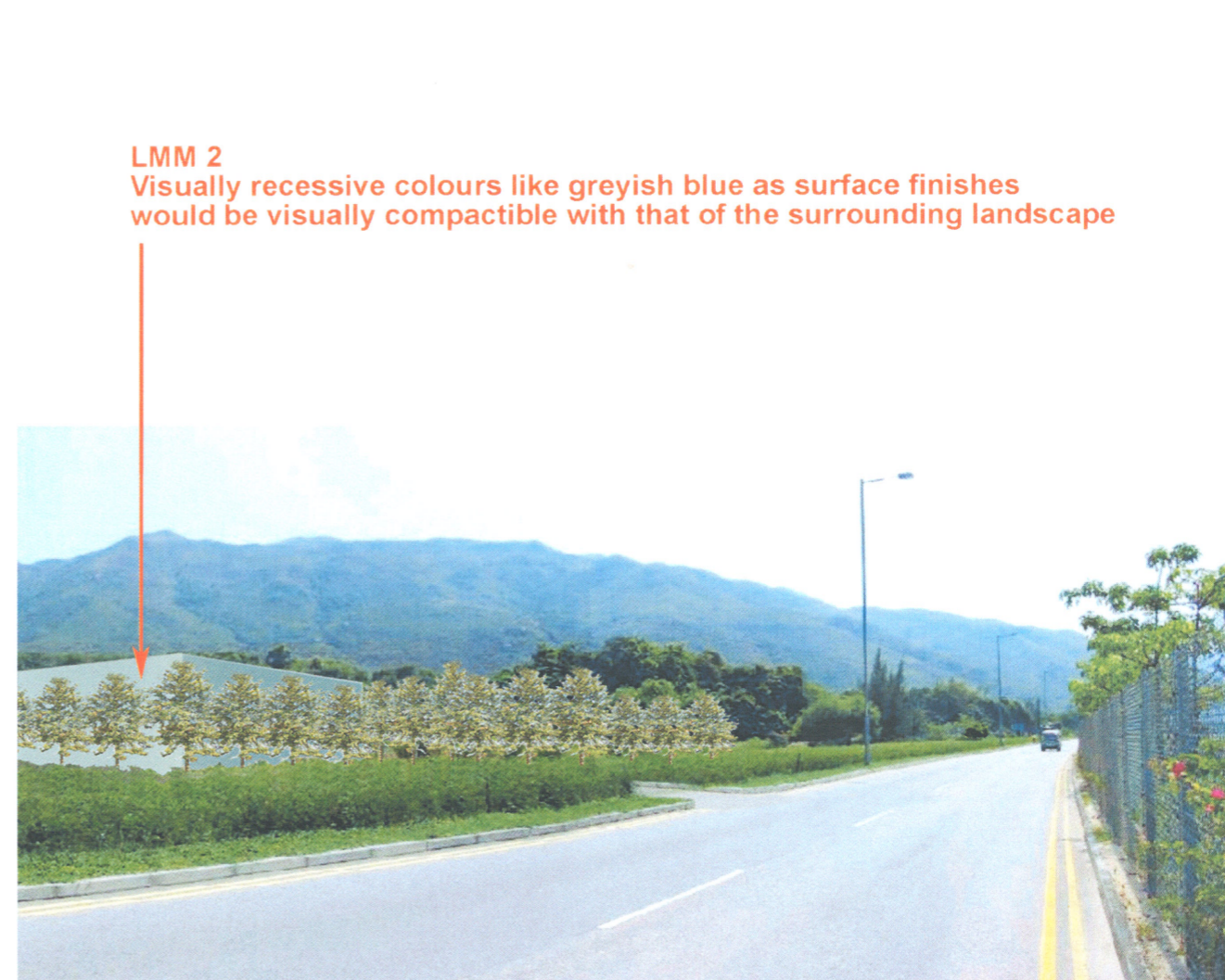
(Alternative Option) KV 1 - PROPOSED SHW RAW WATER BOOSTER PUMPING STATION DAY 1 OF THE OPERATION WITH MITIGATION MEASURES