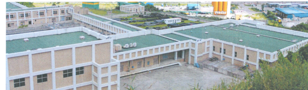
LMM 2: Compatible architectural design, construction materials and finishes with the existing WTW plants.