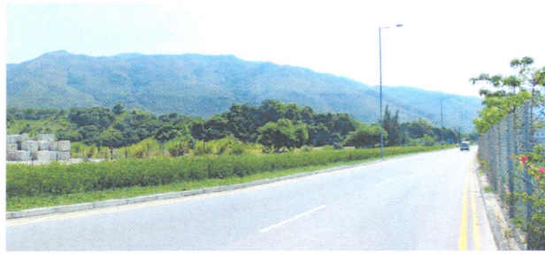
Existing View of KV 1