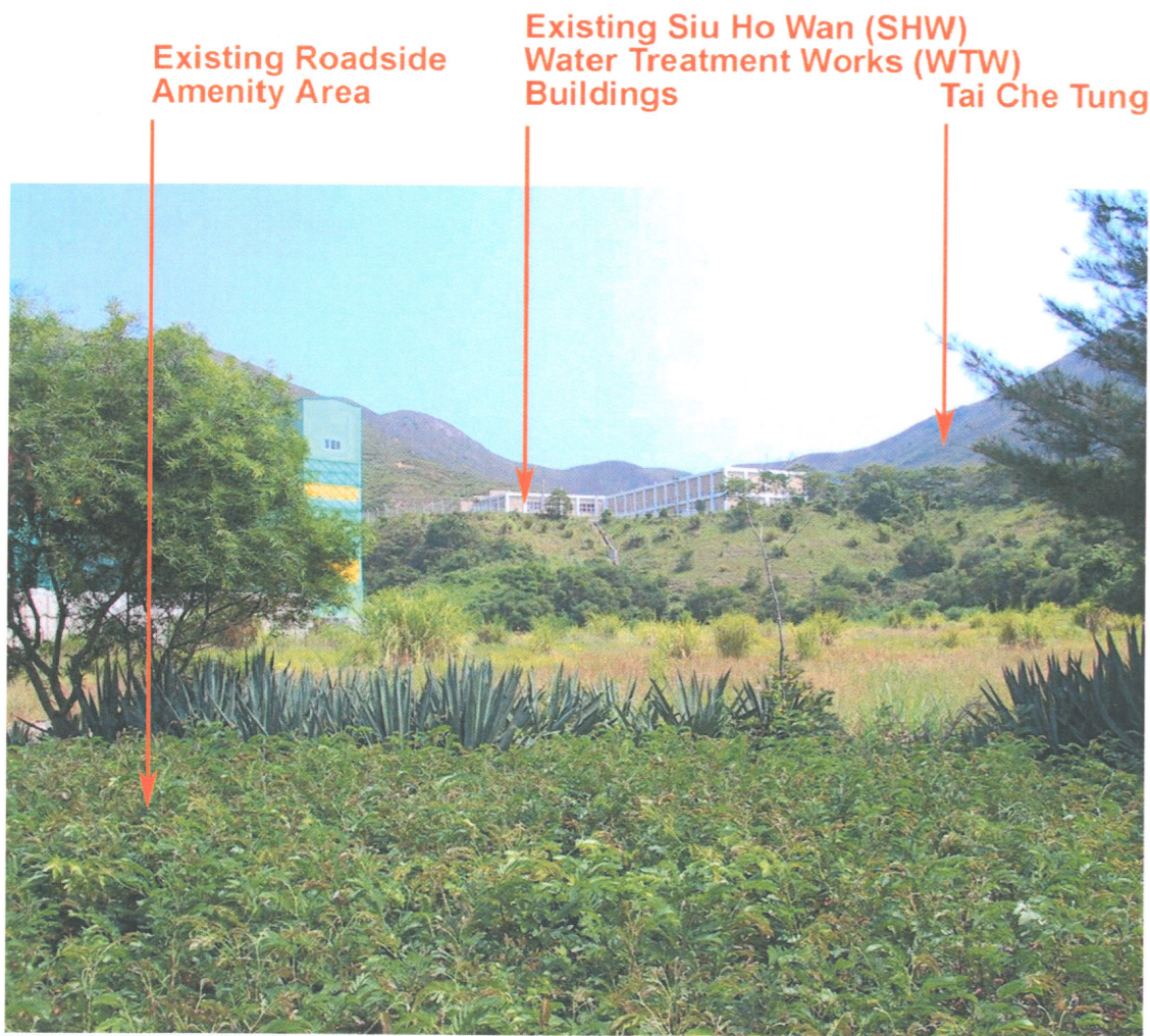
Existing View of KV 2 View from Cheung Tung Road towards east of the Road.