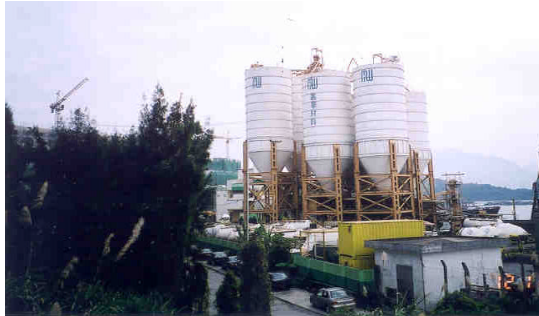
Figure 7.7a Photo showing view from Ting Kok Road (VSR 5) towards the site (prior the project).