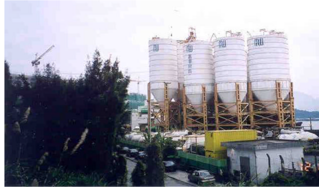
Figure 7.7b Photomontage showing view from Ting Kok Road (VSR 5) towards the site (after the project without visual impact mitigation measures).