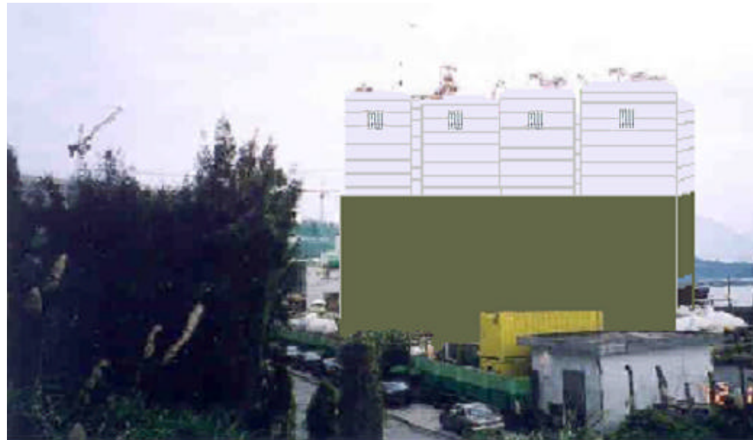
Figure 7.7c Photomontage showing view from Ting Kok Road (VSR 5) towards the site (after the project with visual impact mitigation measures option A).