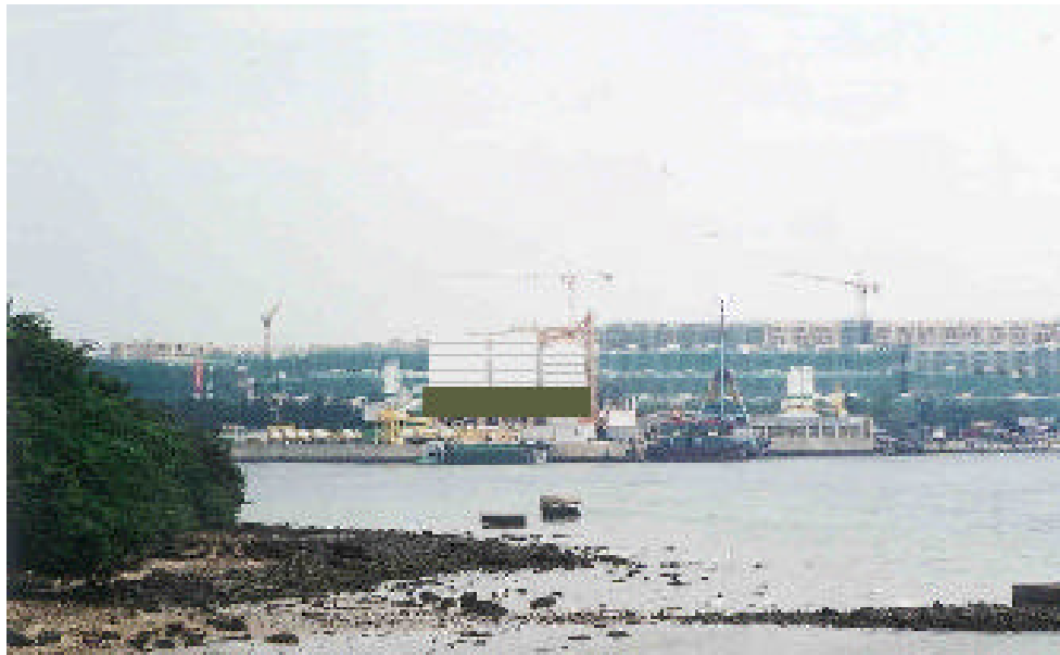
Figure 7.5c Photomontage showing view from Fortune Garden (VSR 2) towards the site (after the project with mitigation measures option A).