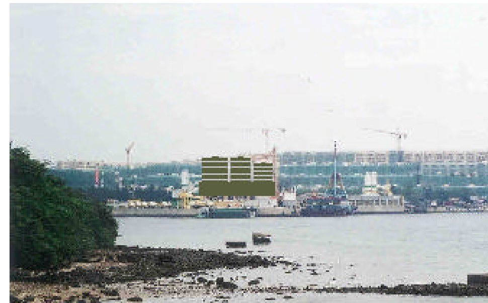
Figure 7.5d Photomontage showing view from Fortune Garden (VSR 2) towards the site (after the project with mitigation measures option B).