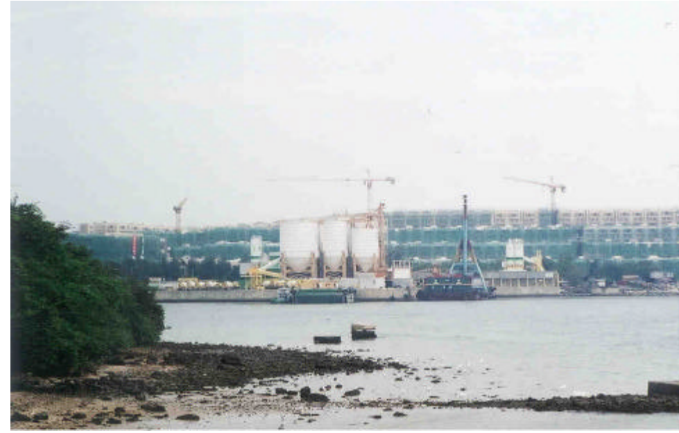
Figure 7.5b Photomontage showing view from Fortune Garden (VSR 2) towards the site (after the project without mitigation measures).