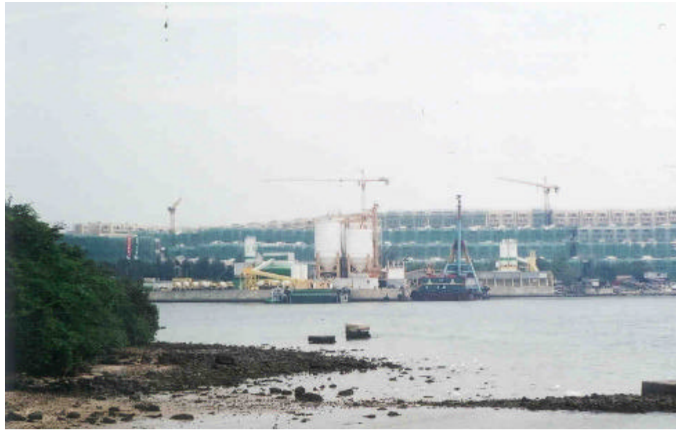
Figure 7.5a Photo showing view from Fortune Garden (VSR 2) towards the site (prior the project).