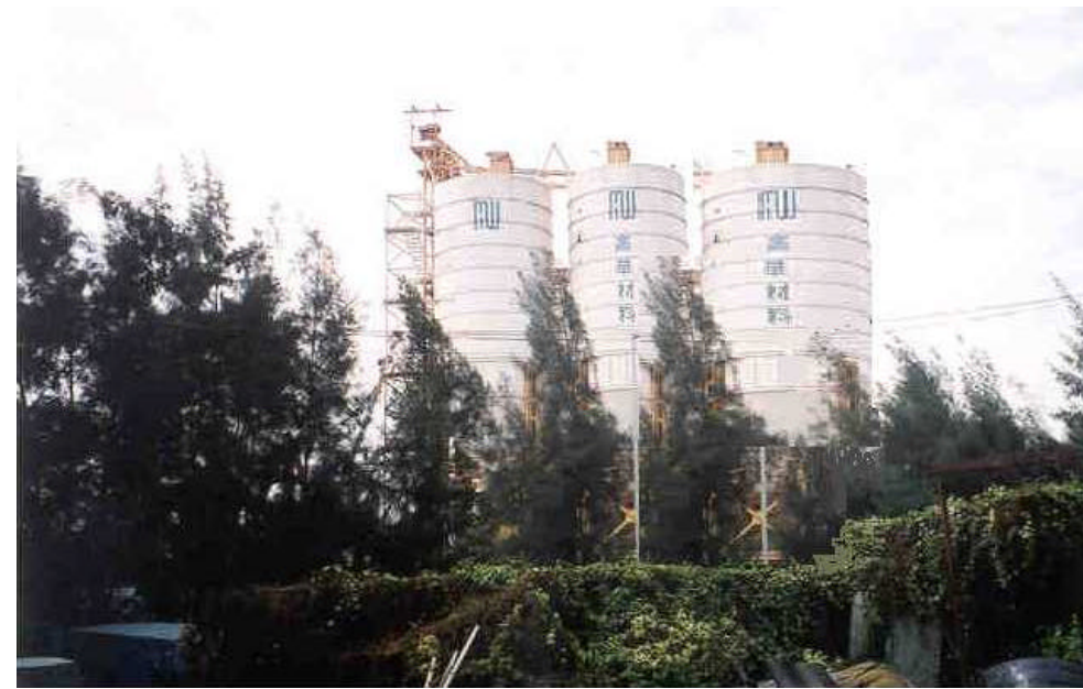
Figure 7.4b Photomontage showing view from Casa Marina III (VSR 1) towards the site (after the project without visual impact mitigation measures).