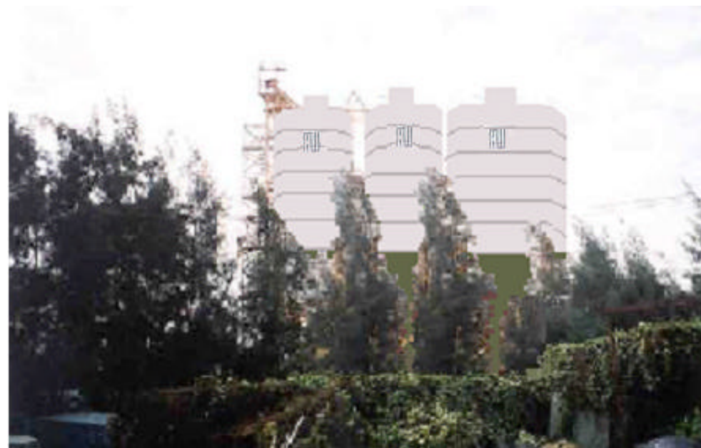
Figure 7.4c Photomontage showing view from Casa Marina III (VSR 1) towards the site (after the project with visual impact mitigation measures option A).