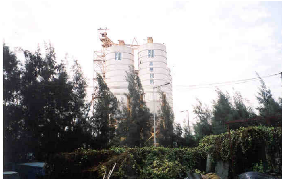
Figure 7.4a Photo showing view from Casa Marina III (VSR 1) towards the site (prior the project).