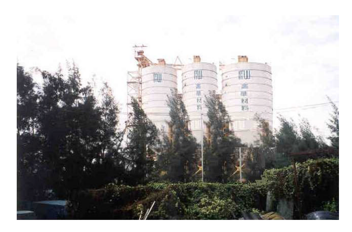
Figure 2b Photomontage showing view from Casa Marina III (VSR 1) towards the site (after the project without visual impact mitigation measures).