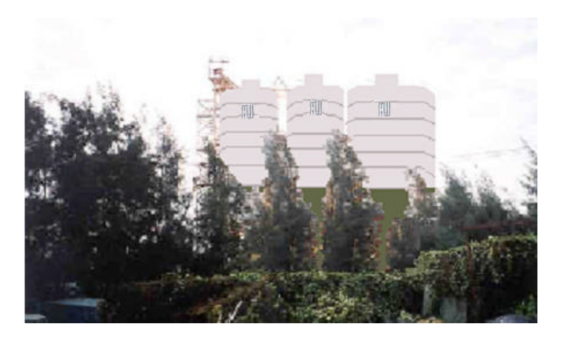
Figure 2c Photomontage showing view from Casa Marina III (VSR 1) towards the site (after the project with visual impact mitigation measures option A).