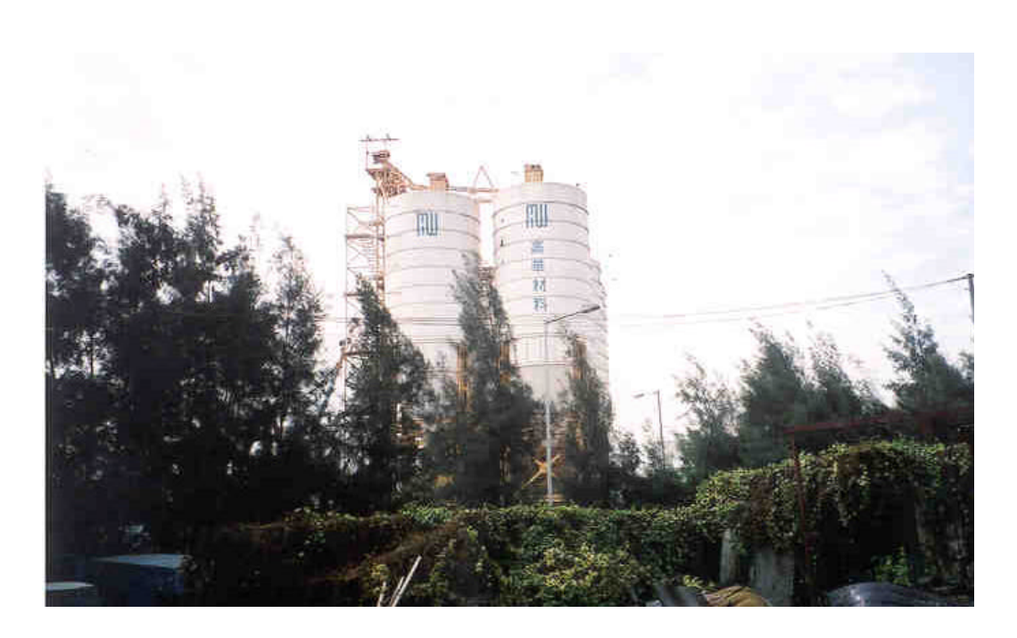
Figure 2a Photo showing view from Casa Marina III (VSR 1) towards the site (prior the project).