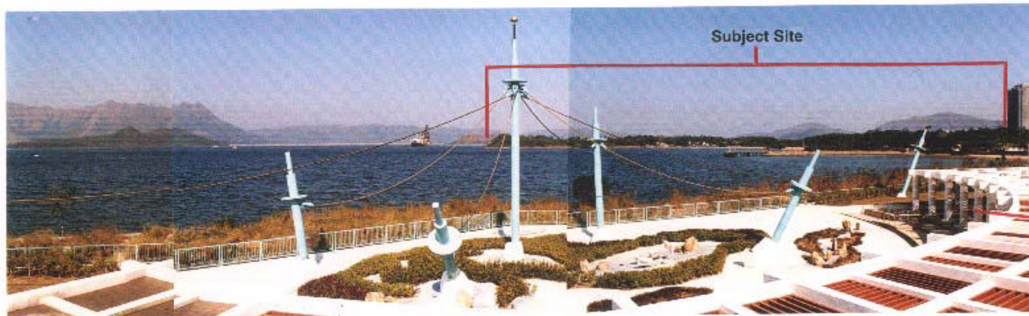
View from Ma On Shan Town park (Key View No. 1)