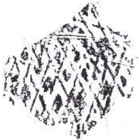
Rubbing of surface decoration on soft geometric sherds