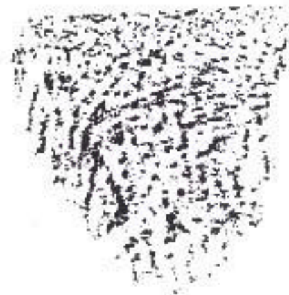
Rubbing of surface decoration on coarseware sherds