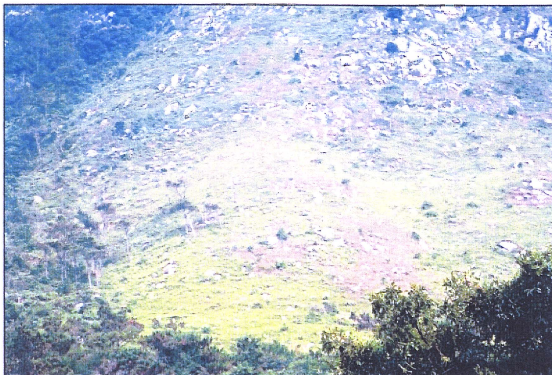
Grassland / Low Shrubland