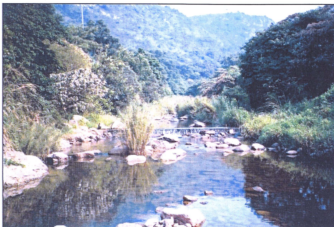
Stream (near Tai O)