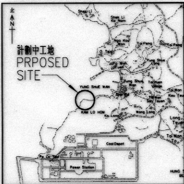
索引圖 KEY PLAN 比例 SCALE 1 : 20 000