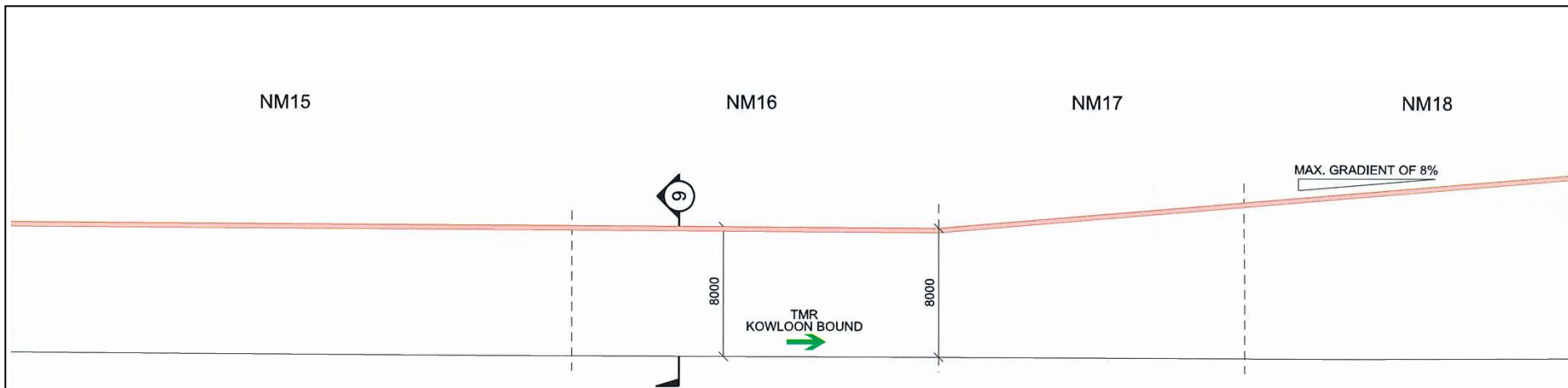
LONGITUDINAL SECTION ALONG TMR KOWLOON BOUND BETWEEN NM15 – NM18 (N.T.S.)