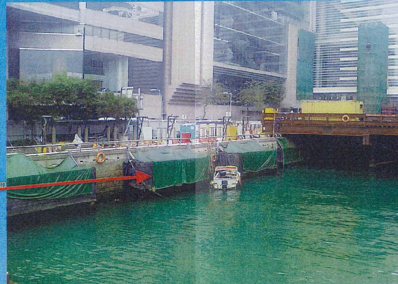
Typical Silt Screen System for Seawater Intake