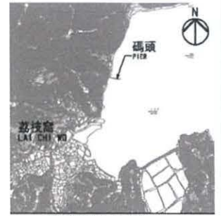
索引圖 KEY PLAN n.r.s.