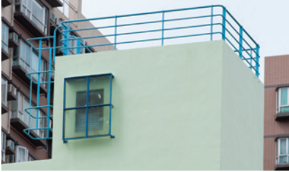
Metal wind guard