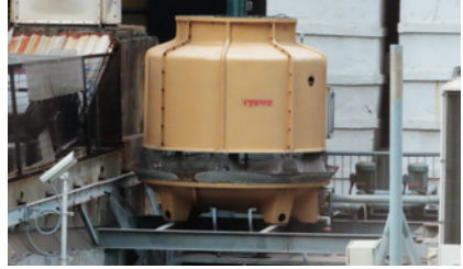
Supporting structure for a water cooling tower