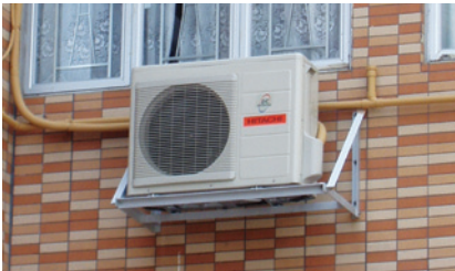
Supporting frame for an air-conditioning unit