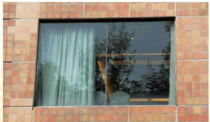
Window or window wall