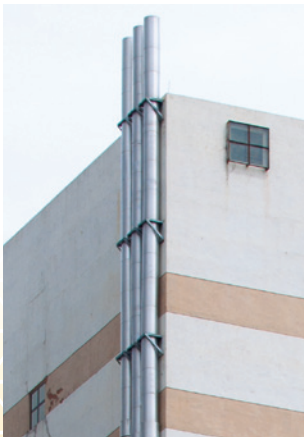
Removal of chimney