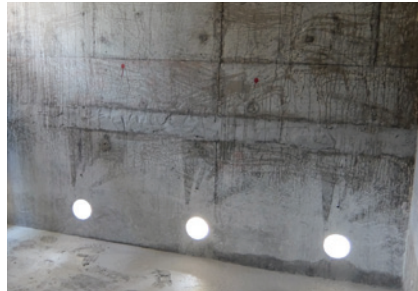
Formation of external wall opening