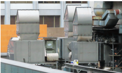
Metal ventilation duct and associated supporting frame