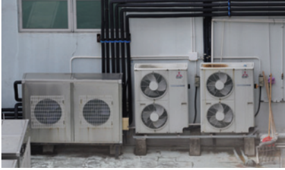
Supporting structure for an air-conditioning unit