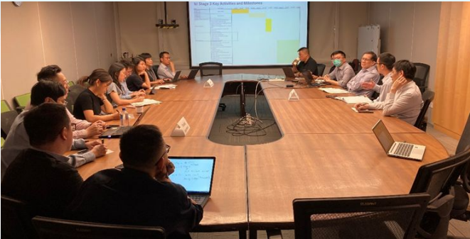
Kick off meeting with Fire Services Department 2 August 2023