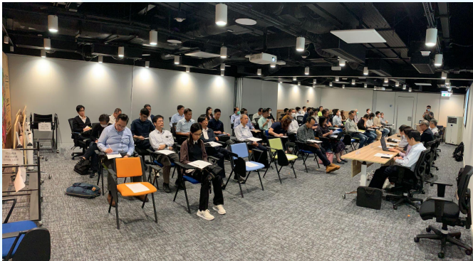
4 th meeting Task Force on the Centralised Processing System of ESH 13 October 2023