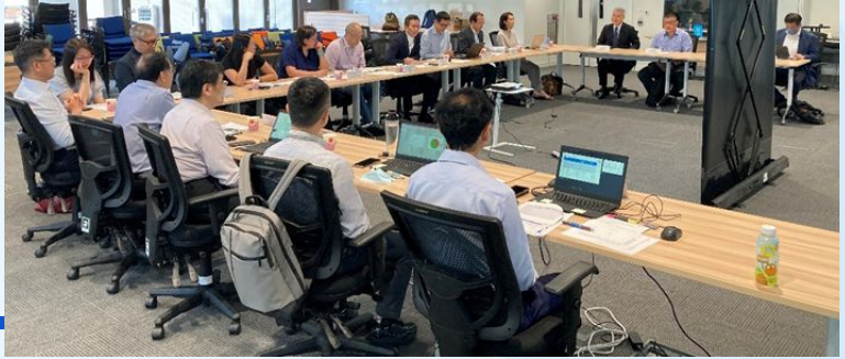
Kick off meeting with Lands Department and Planning Department 28 July 2023