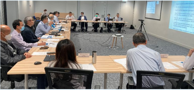
4 th meeting Project Assurance Team 27 June 2023