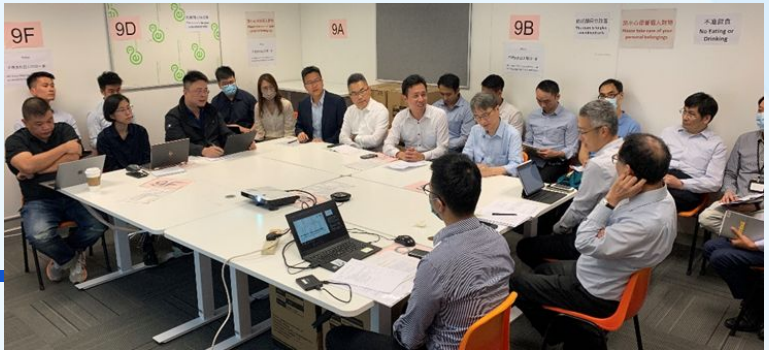
ESH trial workshop to Registered Minor Works Contractor Signatory Association 6 September 2023