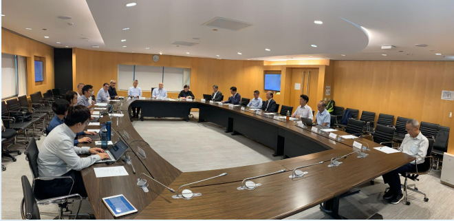
7 th meeting Task Force on Industry Adoption of ESH 29 August 2023