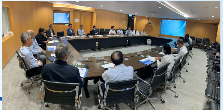
4 th meeting Task Force on the Centralised Processing System of ESH 13 October 2023